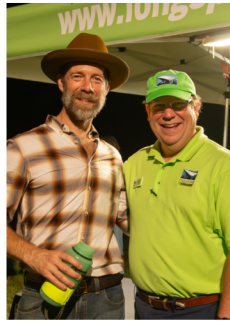
Photo of you with band/artist of sponsored event